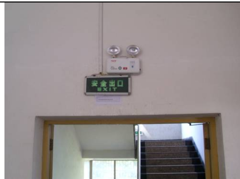
Emergency light & exit sign