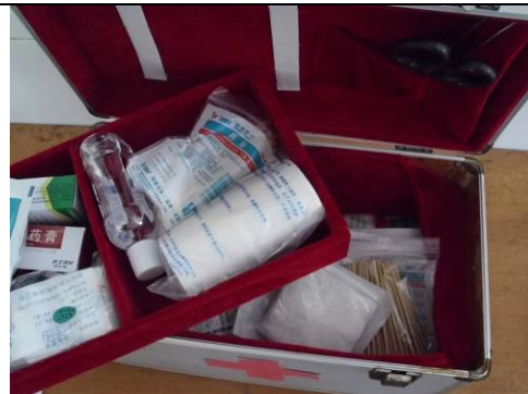
First aid box