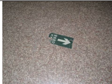
Evacuation route marked