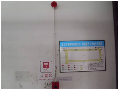
Fire alarm & Evacuation plan